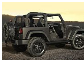
The Worst 15 New Cars of 2015 FORBES