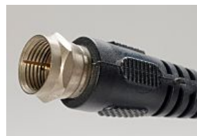
Cable TV Is Dying. Here's What Comes Next The Motley Fool