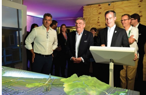
During a 2016 presentation in Rio, LA28 Chairman Casey Wasserman (left) and L.A. Mayor Eric Garcetti emphasized to IOC President Thomas Bach (center) Los Angeles’ deep connection to the Olympic Games.

There’s more optimism than skepticism in the sponsorship community. Yet, a walk-up of nine years is largely untested. Outside of naming rights and other founding sponsorships for new arenas or stadiums, few sports sponsorships of 10 years or more have been offered, much less sold.