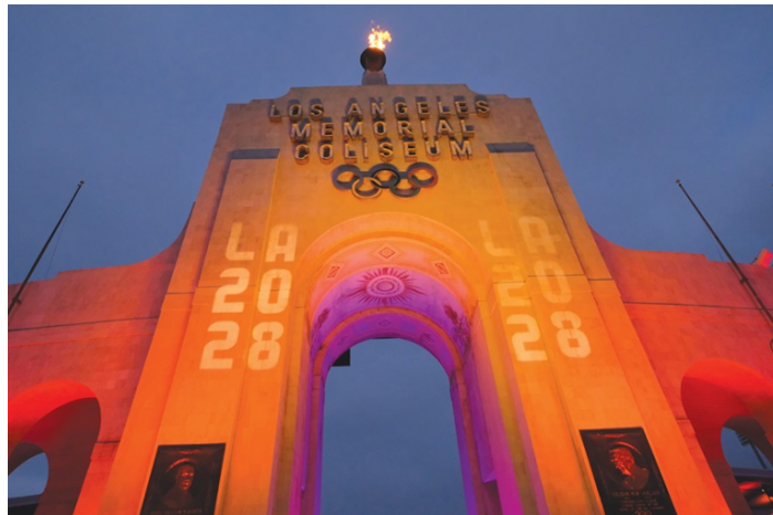
Will the lighting of the Olympic cauldron in 2028 attract the sponsorship spending needed to meet LA28's $2.5 billion goal?